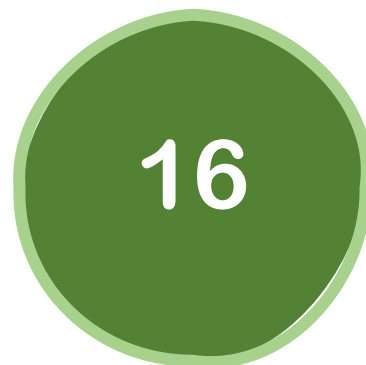
Recommendations to Cabinet/Council